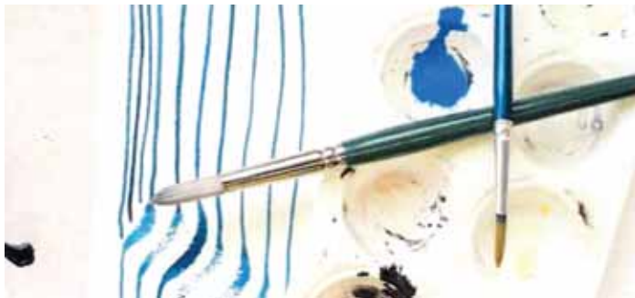
Inspiration for Gesture