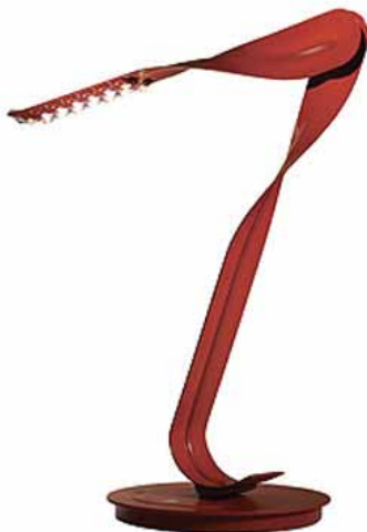
Herman Miller: Leaf

From their personal heating and cooling unit, C2 , that requires 90% less energy than a typical space heater, to a