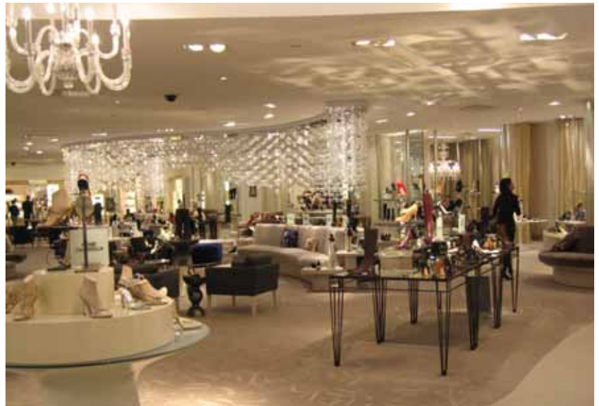
Saks 8th Floor