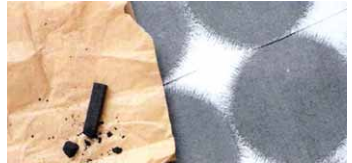
Inspiration for Foundation