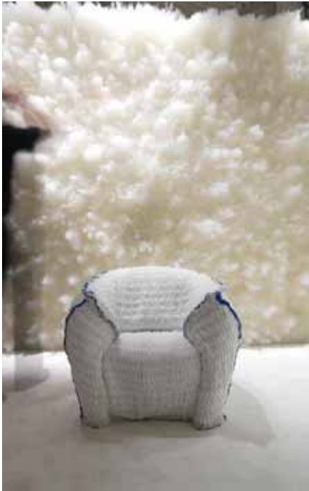
Moroso: Panna Chair

► Moroso USA , Brooklyn, NY, launched the Panna Chair , designed by Toku-jin Yoshioka , Design Miami's 2007 Designer of the Year. The Panna, which means cream in Italian, is based on a soft, enveloping form, and is named for its special upholstery technique, which produces seams that suggest peaks of whipped cream. The Panna Chair is currently offered in a black or white quilted fabric as well as other fabrics and leathers. www.moroso.it .