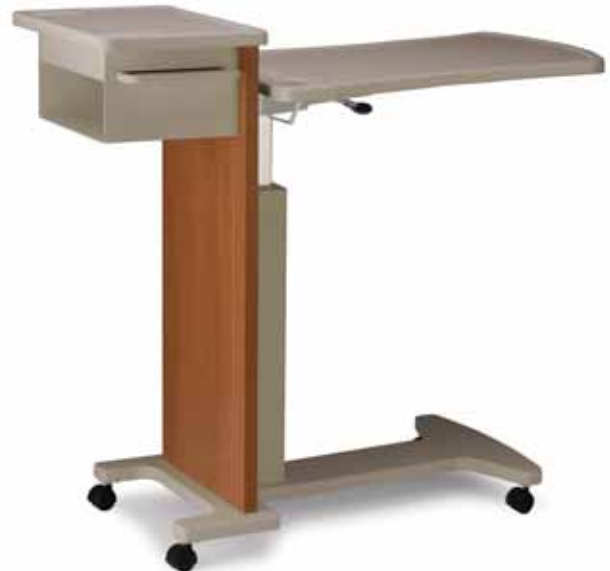
Nuture: Opus Overbed Table