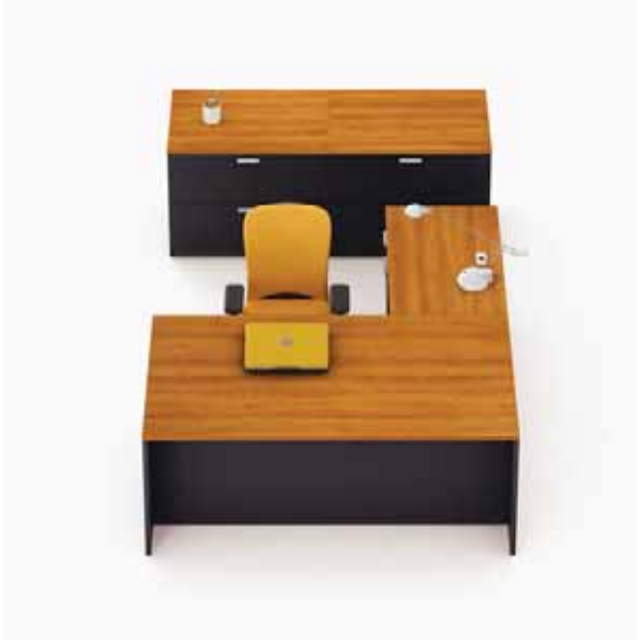
Groupe Lacasse: Morpheo

► Groupe Lacasse , based in St. Pie, Quebec, debuted Morpheo , a new casegoods collection. Morpheo is double GREENGUARD certified for both Indoor Air Quality and for Children & Schools certification. Morpheo workstations can be doubled-up, mirrored, lined side-to-side or positioned back-to-back for numerous configuration possibilities. Two-tone color combinations with anodized aluminum accents and translucent doors give the collection a contemporary look.