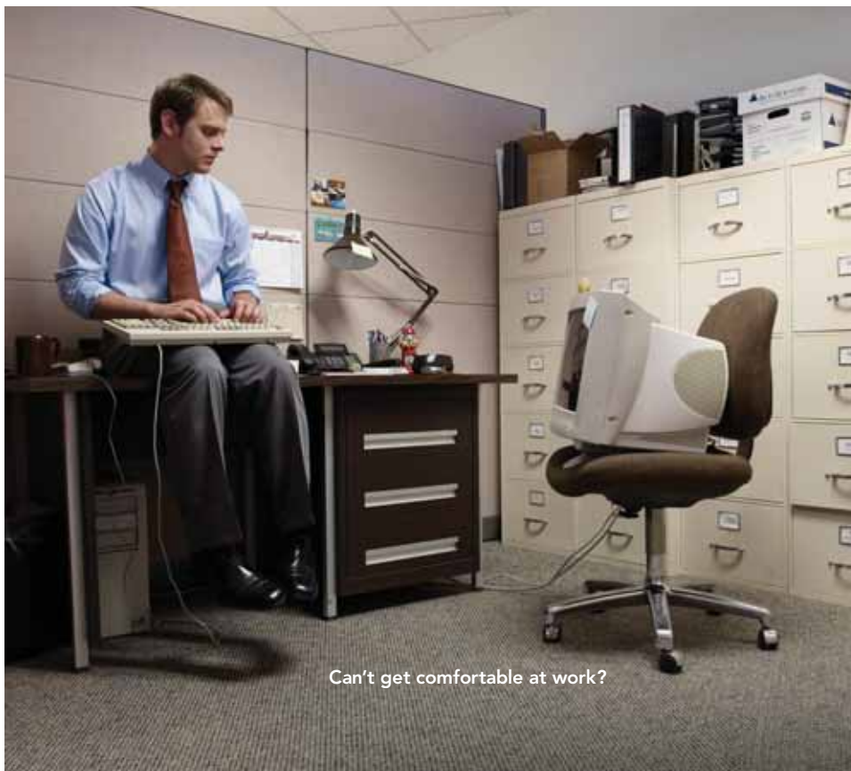
Can't get comfortable at work?