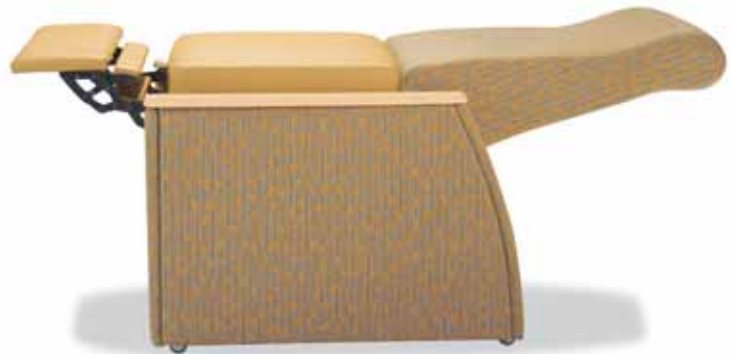
IoA: Connect Chair