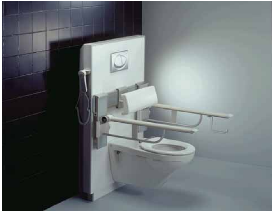
Pressalit: Height-Adjustable Toilet

The Pressalit Care Height-Adjustable Toilet brings enhanced independence and comfort to individuals with impaired mobility. Level transfer from a wheelchair is facilitated, and adjustable support arms add safety and ergonomically appropriate support. The steel frame supports up to 400 lbs., and the low-maintenance polycarbonate façade wipes clean with soap and water. The toilet is housed in an understated flat cabinet designed to minimize its presence in the toilet space, while a large split-flush control is designed for easy use by people with little to no twist or grip capacity. ▲