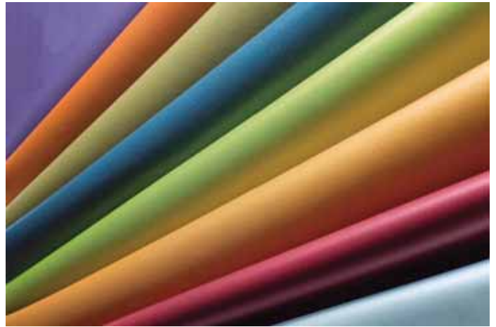
cf stinson: agION Upholstery Collection